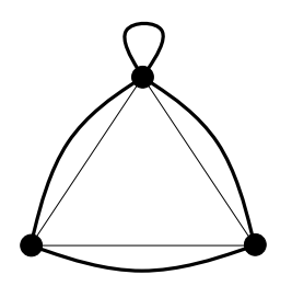
FIGURE 1. Even cycle representation of F_7 . Bold edges are odd, thin edges are even.